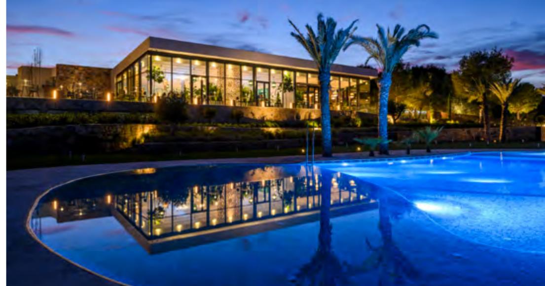
Right: Night view of the swimming pool Middle left: Enjoying the cycle trails. Middle right: Tennis academy and multi-sports courts. Bottom right: View from Las Colinas beach bar