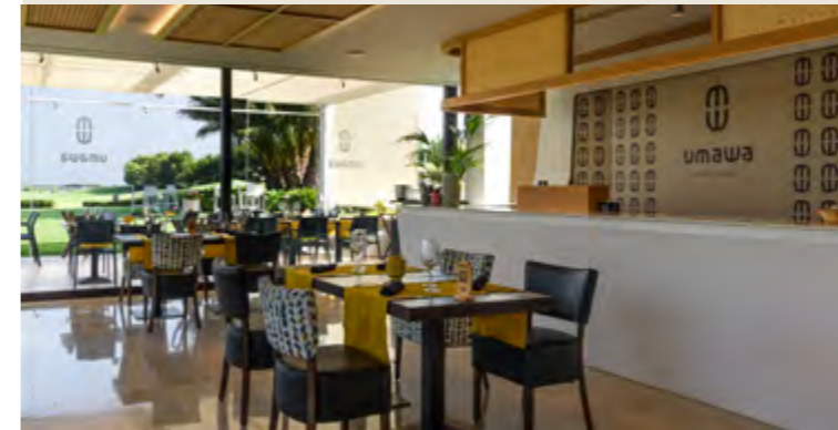
Above: The Italian-inspired Il Palco restaurant. Left: Nikkei cuisine at the Umawa restaurant

Of course it's time for the face dive into the pillow test. The smell and feel of crisp cotton pillowcases and sheets fill my senses, and a nice firm mattress is exactly what I had hoped for. The large bathroom has a bath/shower combination with a sink, toilet and bidet and plenty of towels and free toiletries for those who are only bringing a cabin bag for a long weekend.