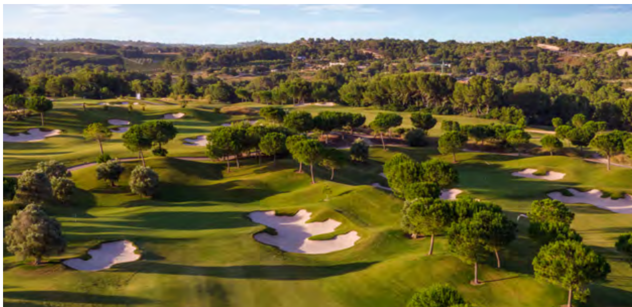
Left: Course overview Bottom left: Narrow green at the par 3, 10th hole. Below: Aerial view of the 11th and 12th holes

The par 4 16th that is sandwich in the middle is a great hole measuring 419 yards but the framing of the hole with the bunkers, like the rest of the course before it, looks visually stunning. Making my way off the course and sitting on the patio outside the club house with cold refreshments being consumed and stories swapped, one thing we are all agreed on: we can't wait to get back out there again tomorrow.