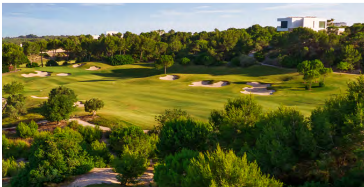
Top left: Looking down the 1st hole. Left bunkering on the 9th hole.

After a well-deserved hotdog at the halfway hut which sits sheltered in some trees, I head →